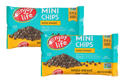
10 oz. Enjoy Life Gluten Free Semi-Sweet Chocolate Chips

save at least $4.00 each with your VIC card