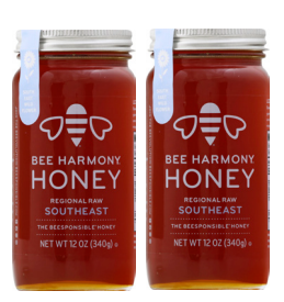
12 oz. Bee Harmony Regional Raw Southeast Wild Flower Honey

save at least 80¢ each with your VIC card