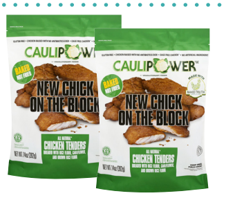
14 oz. Caulipower Chicken Tenders