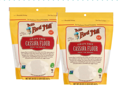
20 oz. Bob's Red Mill Grain Free Cassava Flour

save at least $1.00 each with your VIC card