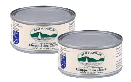
6.5 oz. can Bar Harbor Chopped Sea Clams