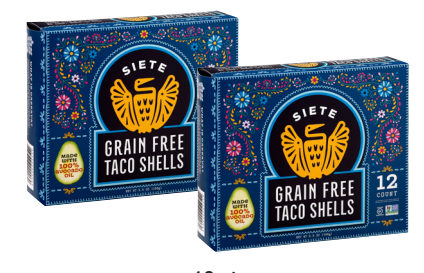
12 ct. Siete Grain Free Taco Shells

save at least $2.00 each with your VIC card