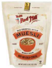
Muesli Old Country Style 18 OZ