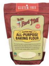
All-Purpose Baking Flour 22 OZ