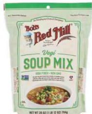
Soup Mix Select Varieties 28 to 29 OZ