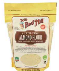
Super-Fine Almond Flour 16 OZ