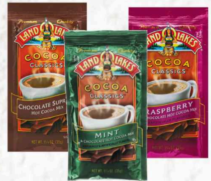
Land O Lakes Cocoa Classics Select Varieties 1.25 OZ