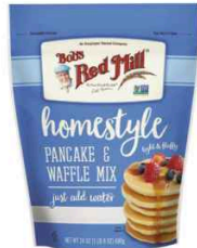
Homestyle Pancake & Waffle Mix 24 OZ