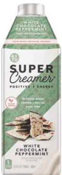
Kitu White Chocolate Peppermint Super Creamer 25.4 FL OZ