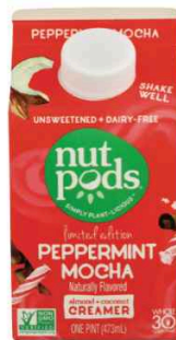
Nutpods Peppermint Mocha Creamer 16 FL OZ