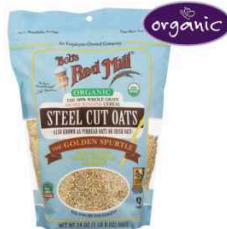
Organic Steel Cut Oats 24 OZ