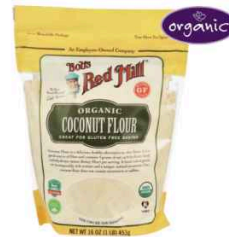
Organic Coconut Flour 16 OZ