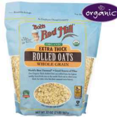
Organic Thick Extra Rolled Oats 32 OZ