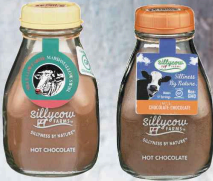
Sillycow Farms Hot Chocolate Mix Select Varieties 16.9 OZ