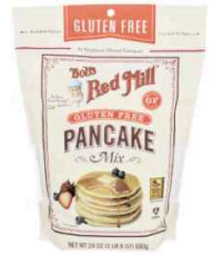
Gluten-Free Pancake Mix 24 OZ