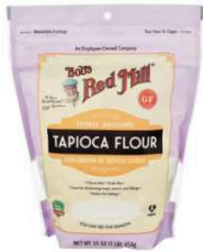
Tapioca Flour 16 OZ