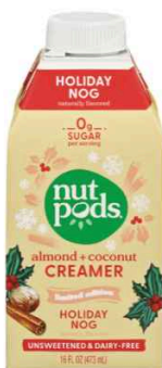
Nutpods Holiday Nog Creamer 16 FL OZ